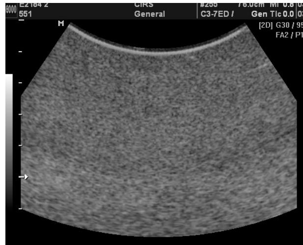
Ultrasound scan of CIRS Accreditation Phantom for Uniformity using Curved Array.