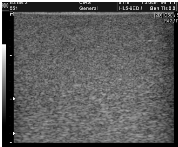
Ultrasound scan of CIRS Accreditation Phantom for Uniformity using Linear Transducer.