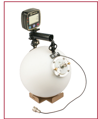
upper left: detail of display unit lower left: base of instrument