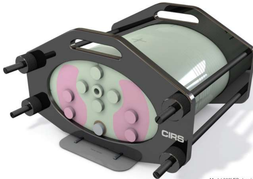
Model 002LFC showing optional water equivalent rod with ion cavity