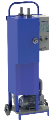
AS 5000 in mobile configuration