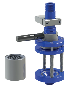
Filter holder TPHP (quick replacement of filters)

A simple rotational movement of the handle releases the cartridge holder of filter paper holder without need of disconnecting it from air sampling circuit.