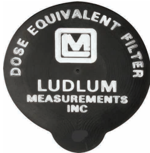
Ambient Dose Filter